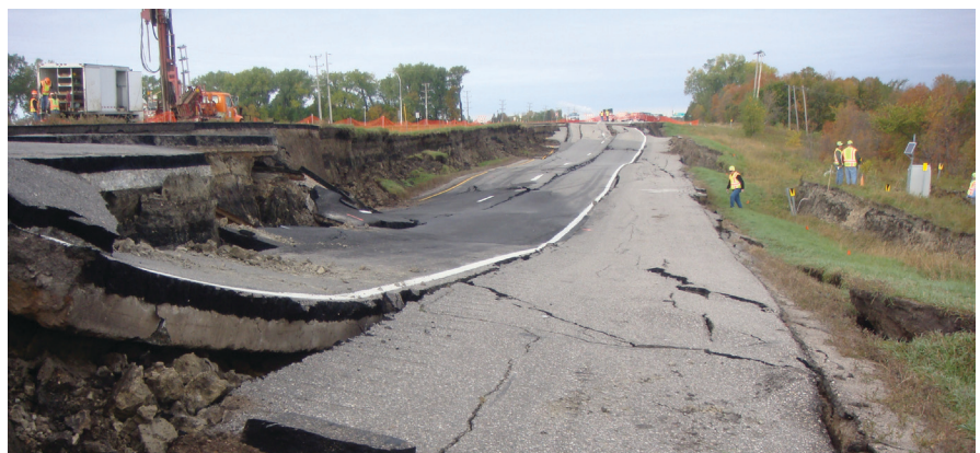
Figure 2. SAA systems reported and recorded a significant landslide event in near-real-time to geotechnical offices five hours away. The SAA systems remained fully operational as over 100 inches (2.5 m) of lateral deformation was measured.

While not immediately appreciated, it became clear that SAA systems had additional advantages over manual systems. The sensors can be polled even in poor weather conditions such as when the installation area may be covered with snow and ice. SAA systems also continue to function when the sensing elements are below floodwaters. The ability to monitor a